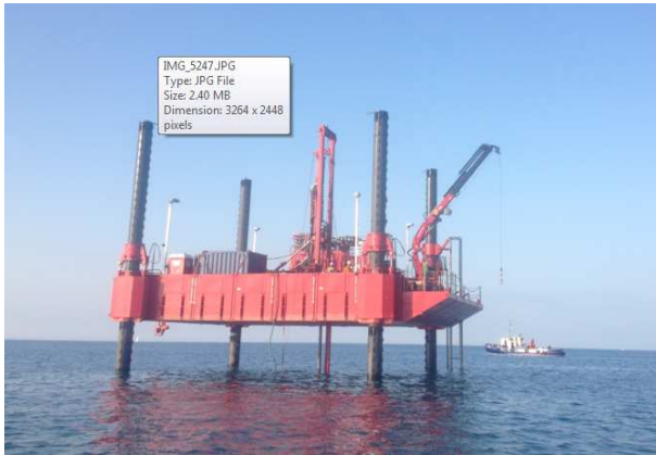
Skate 3E – Drilling jack-up platform

The following vessels may be involved during the project (this is indicative and subject to change)