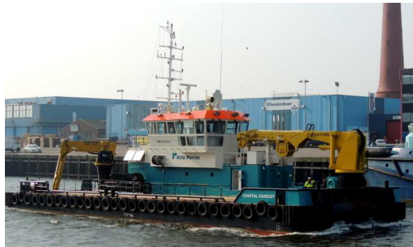
Coastal Chariot - Multicat