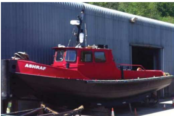
Ashraf – Tug/Workboat