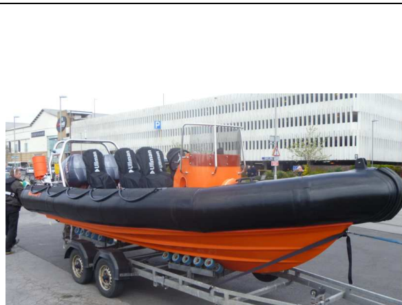
RIB – Crew Transfer Vessel